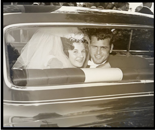
Wedding Day 09/28/1963