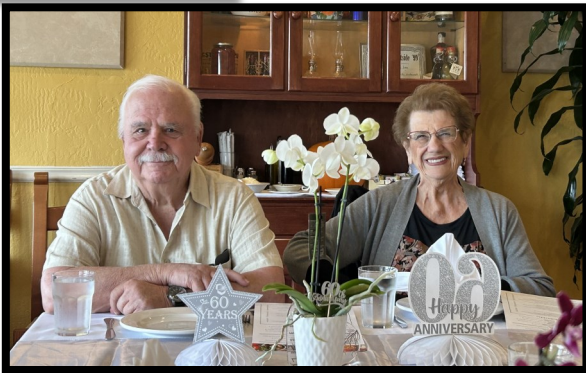
60th Anniversary 09/28/2023